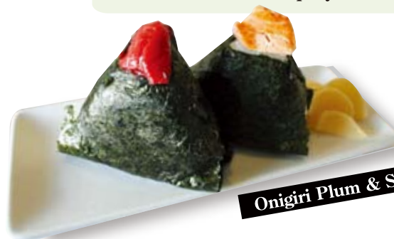
Onigiri Plum & Salmon