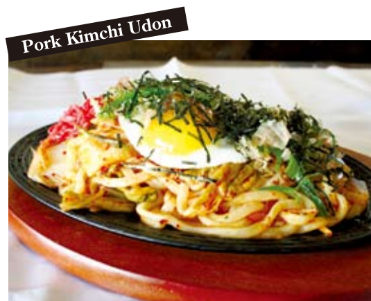
Pork Kimchi Udon