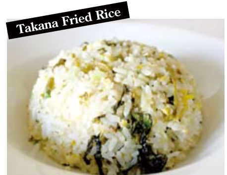
Takana Fried Rice